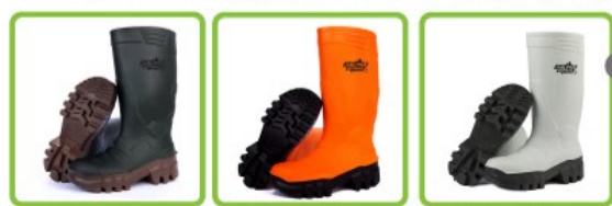
Green | Brown